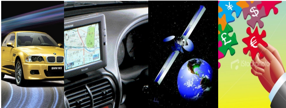
Connecting people and places through GPS, mobile and wireless communication